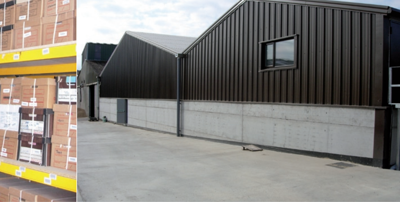
Original images by the MOBOTIX cameras

installation of a backbone network for the cameras, was completed in June 2005.