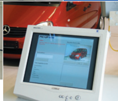
Uniform photo sets make a uniform statement. The photos taken by the MOBOTIX camera displayed with the vehicle data on the computer screen (bottom right).

lighting at all three locations to ensure a consistent presentation of the vehicles. The cameras were then mounted on a mobile photo station with a monitor and connected directly to the LAN. Despite these efforts to create photos with a standardized look, the same question came up again and again: How can vehicles of different types, sizes, shapes and colors all be photographed so that each vehicle is best presented and all the photos have a uniform, professional look without having to invest a lot of time and money?