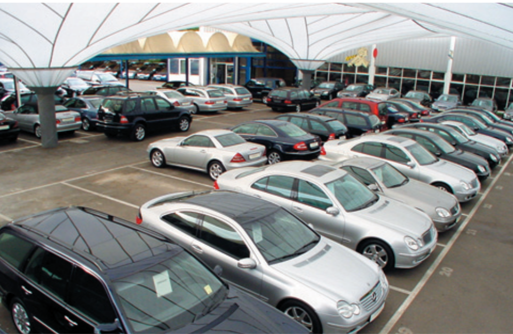
More than 10,000 used company cars are sold each year.