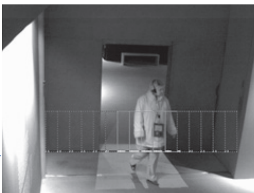
Sharp images even in the dark: original images taken by MOBOTIX cameras.