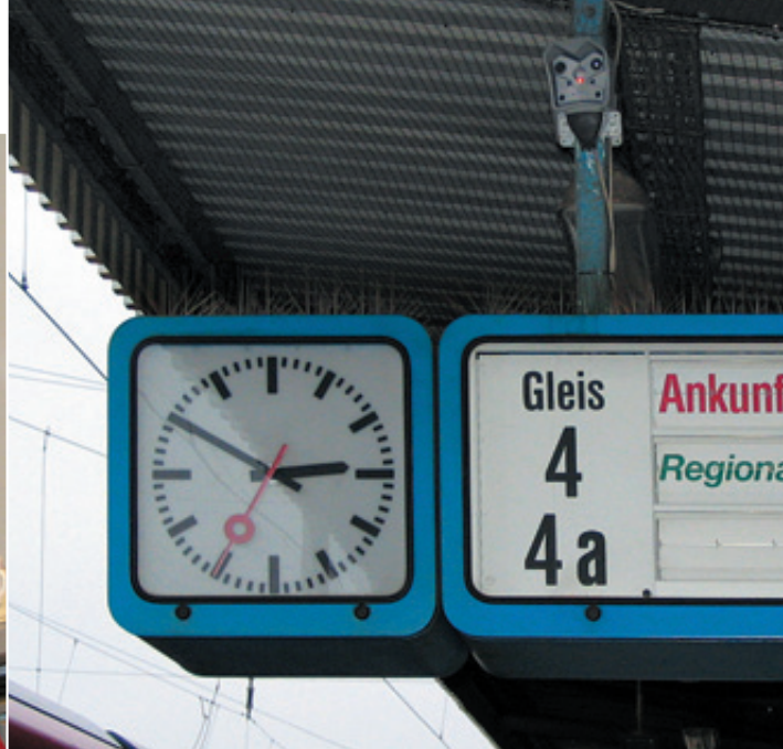
One of the three announcement points at Magdeburg central station.